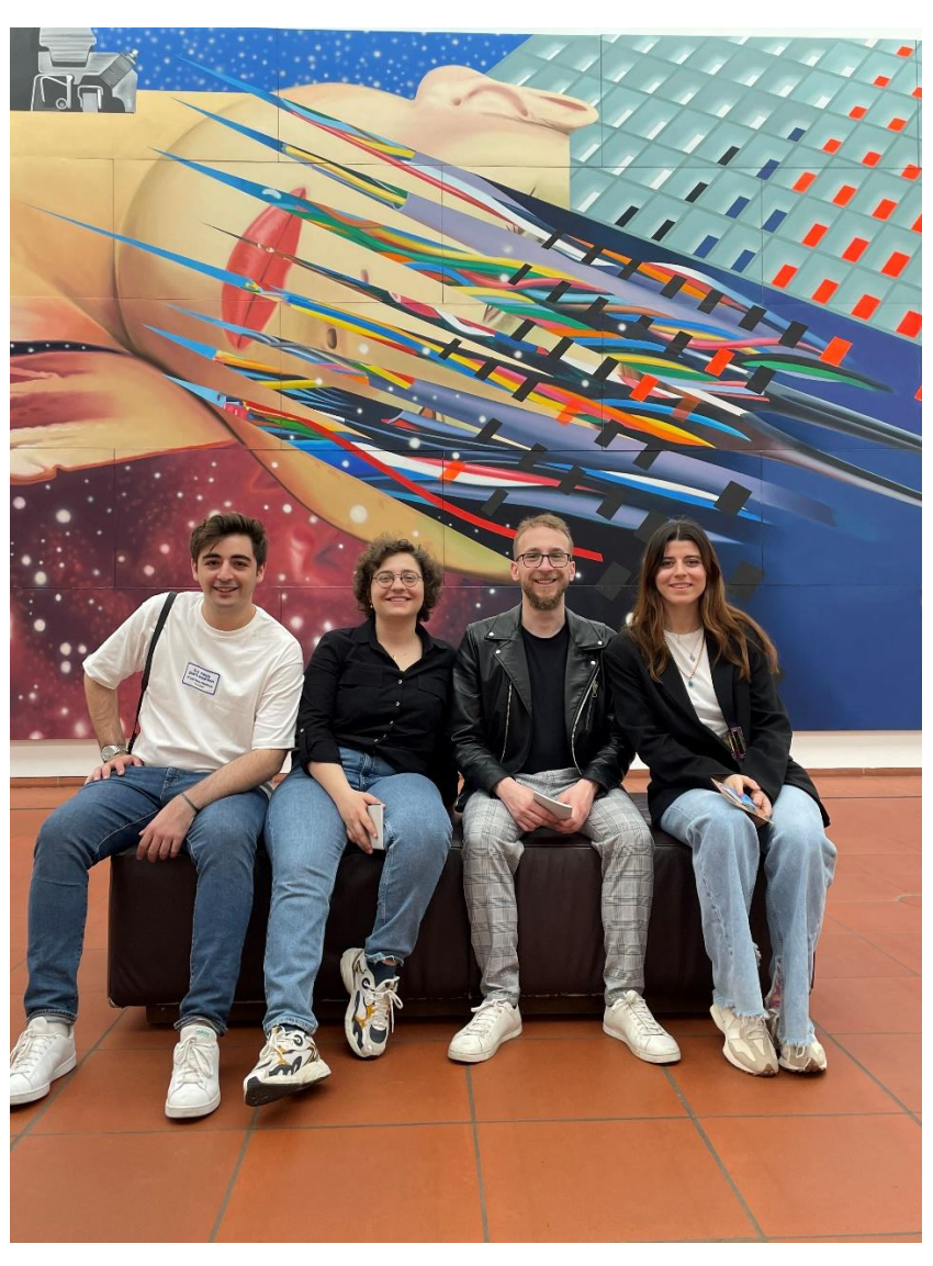
Our TGU students during their visit to Ludwig Museum in Cologne

During the excursion, the first and last few days were dedicated to immersing our students in Cologne's rich cultural offerings. Our group of eager learners embarked on an exciting journey, starting with visits to two prominent museums that hold significant historical and artistic treasures: the Ludwig Museum and the Wallraf-Richartz Museum. At the Ludwig Museum, the students were captivated by an array of modern and contemporary art pieces. The striking exhibits showcased the boundless creativity of renowned artists, both local and international, offering a glimpse into the ever-evolving world of art. From thought-provoking paintings to thought-provoking sculptures, the students were encouraged to interpret the artwork's meaning and appreciate the various artistic techniques.