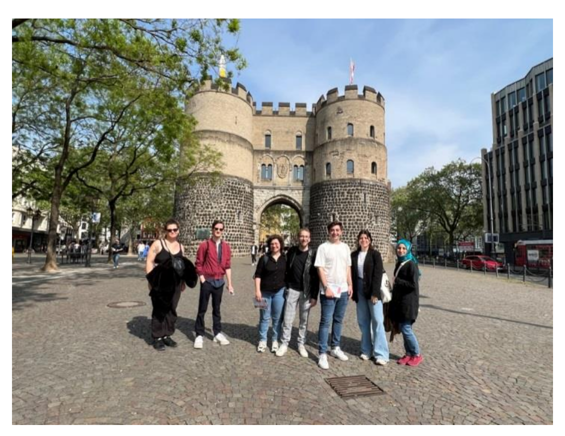
Our students during the Cologne City Tour.

In addition to these museum visits, our students enthusiastically participated in a city tour, which allowed them to witness Cologne's vibrant and dynamic atmosphere. They meandered through bustling streets, lined with charming architecture, and absorbed the city's pulsating energy. A particular highlight of the tour was their visit to the Cologne Cathedral, a majestic masterpiece that stood as a testament to the city's enduring history and architectural prowess. The students were humbled by the grandeur of the cathedral's interior and learned about its cultural and religious significance.