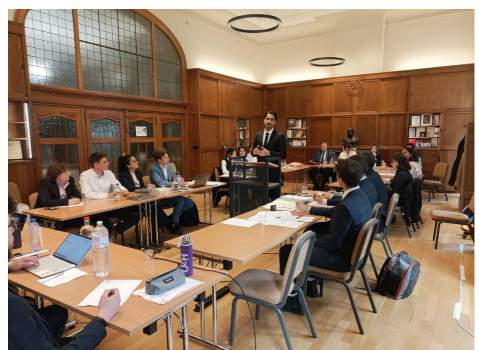
All students during the Moot Court in Brussels