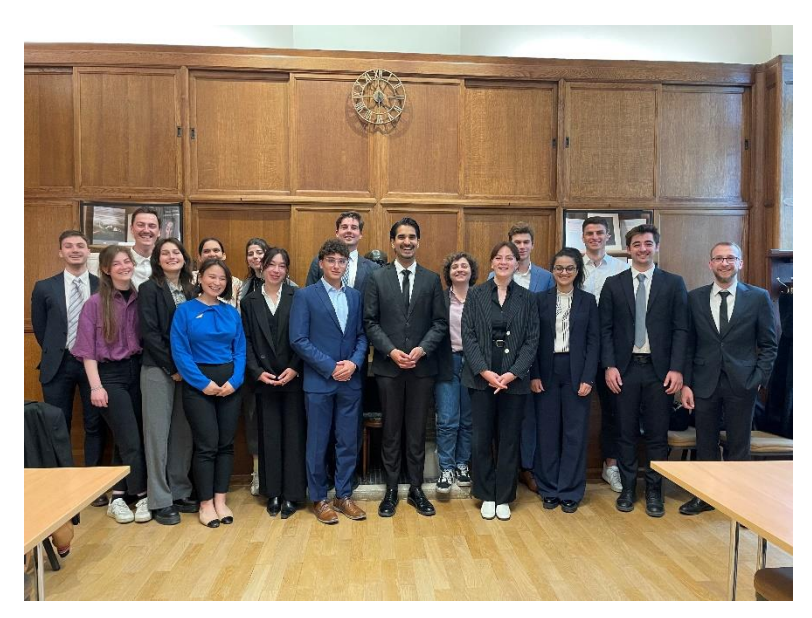
Our students together with the PROTEUS group in Brussels.

During their stay in Brussels, 4 TGU students collaborated with 14 students from the political science and law departments of UoC to organize and conduct a Moot Court. This collaborative effort was part of the interdisciplinary and international seminar known as PROTEUS, which focused on the law and politics of the European Union. The PROTEUS seminar served as a platform to familiarize the students with current European affairs, culminating in an excursion to Brussels. During their time there, the students not only had the privilege of experiencing the key institutions of the European Union (EU), but they also actively engaged in a moot court session. Throughout the program, the students demonstrated a high level of interest in the expansive field of political expertise and were captivated by the diverse array of potential job opportunities.